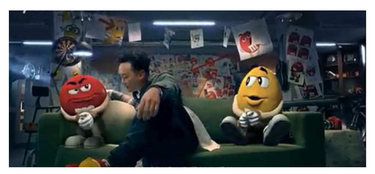
Figure 2: Celebrity-based advertisement of of M&M's.

This study analyzed the first question through interviewees' attitudes about their idols, which associated with their consumption. For example, some questions like will you have the desire to buy something which is not useful but only endorsed by your idol? After that, they will watch two advertisements in the same brand (M&M's), one of which is endorsed by a famous Chinese singer Eason Chan (Figure 2) and another focus on its creative content (Figure 3), expecting to discover the attractive elements (celebrities or creative contents) for them. Several questions such as what are the most impressive points of the two advertisements in your mind, whether you will share advertisements you like with others on platforms?