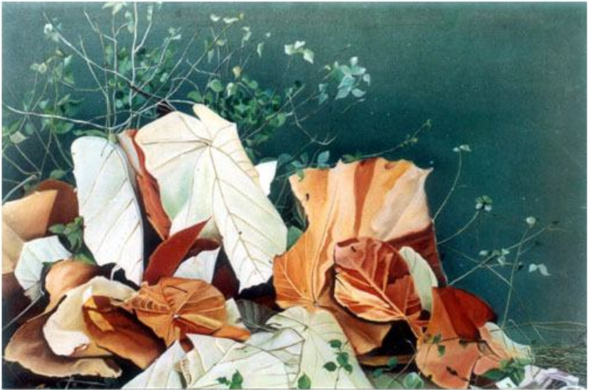
Title: Stonescape-1 Oil on Canvas