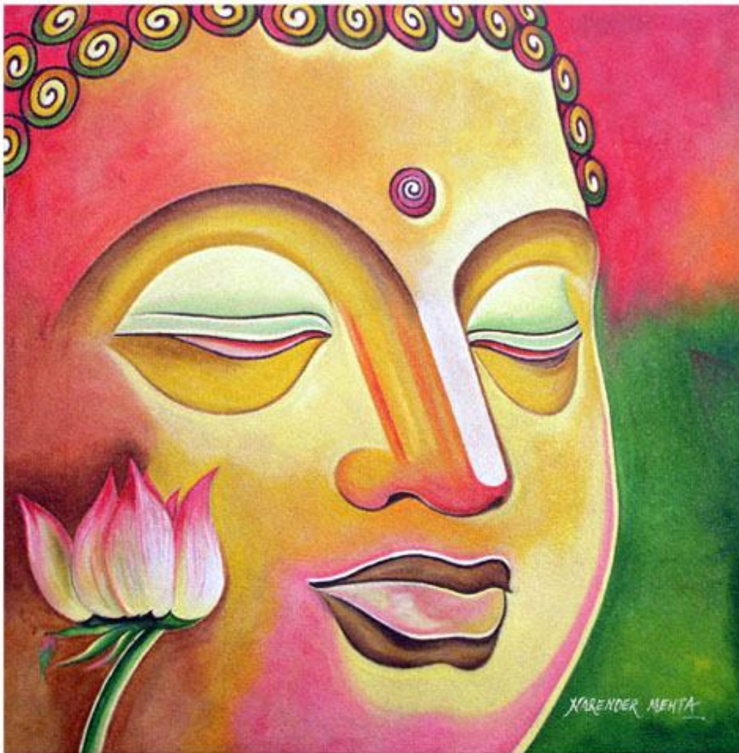
Title: Buddha-12 Oil on Canvas