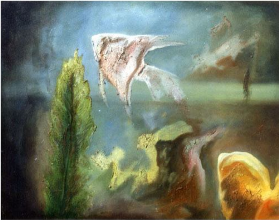
Title: Fish Series-1 Oil on Canvas