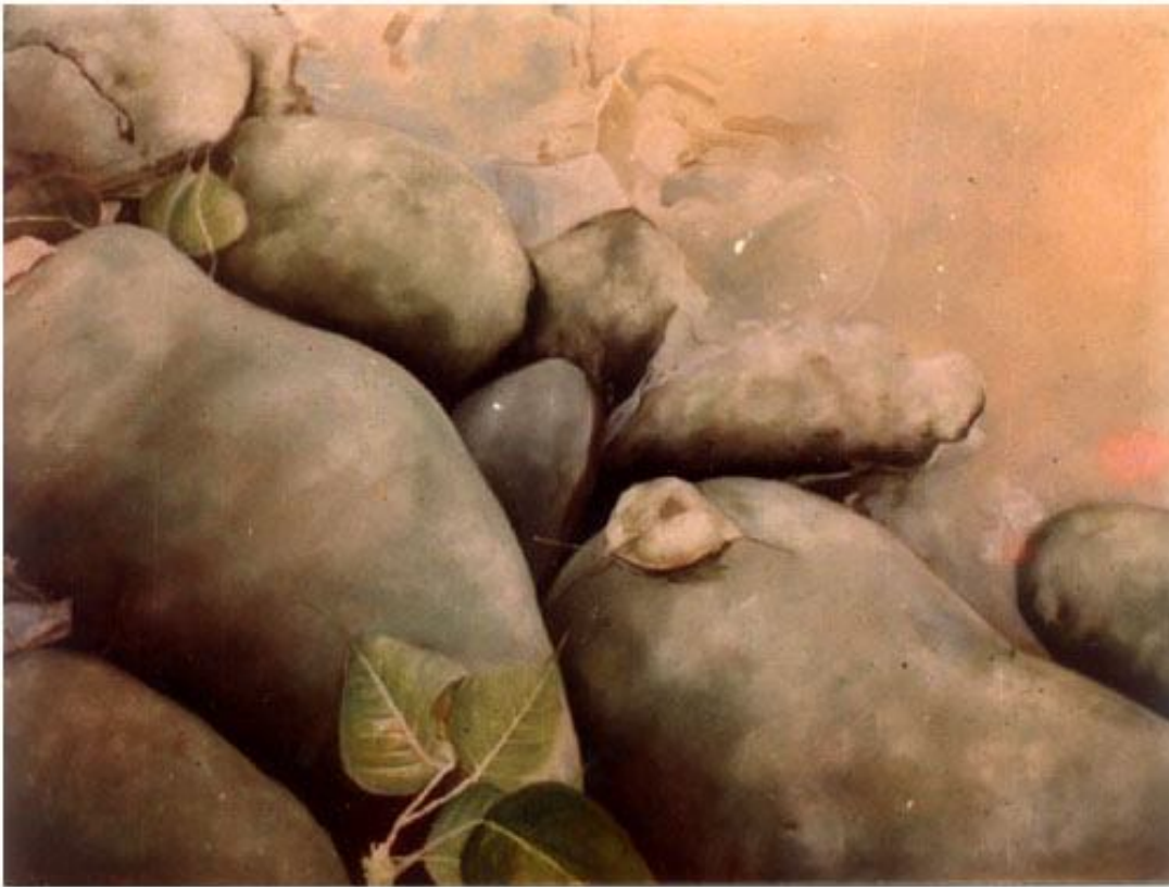
Title: Stonescape-1 Oil on Canvas