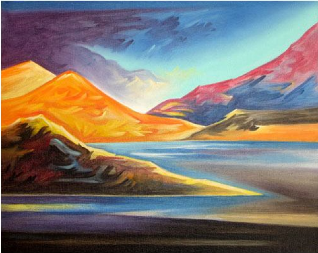
Title: Landscape-13 Oil on Canvas