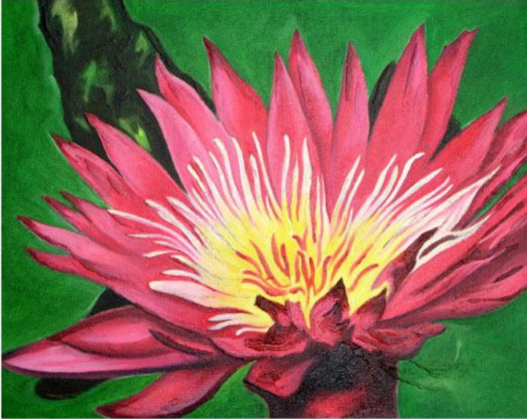
Title: Flower-3, Oil on Canvas