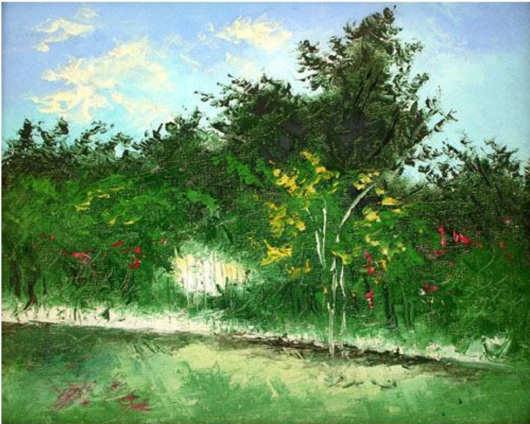
Title: Landscape-2 Oil on Canvas