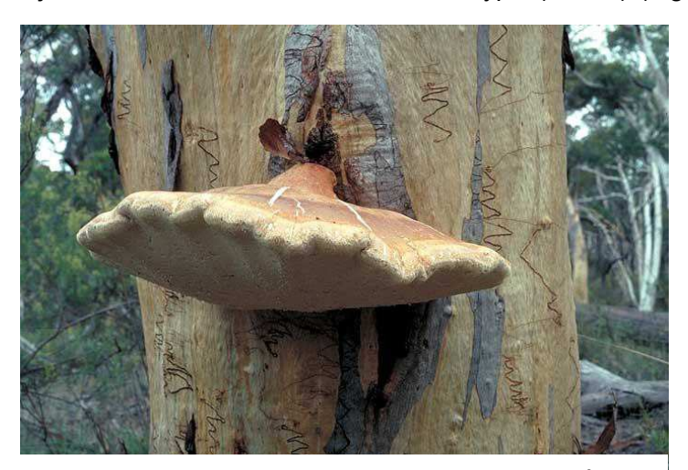
Fig 6. White Punk (Laetiporus portentosus). Photo<sup>6</sup>

The four-part "Idyllatry" begins with Part I, "Laetiporus portentosus," the scientific name for the White Punk fungus: "It has weathered the storms, though its white/ punk posture has injected rot into the heart/ of the eucalypt" (II. 1-3) (Fig. 6). Kinsella's connotation of "rot" here