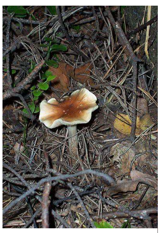
Fig 5. Psilocybe cyanescens. Krzysztof Blachnicki. Photo.5

Although Michael Dransfield passed away at the age of twenty-four, he left behind a considerable body of work, some of which deals with his intoxication (Kinsella "Biographical" 404). "I do this i do that" (Dransfield 163) is about the psychotropic genus of mushroom Psilocybe (Fig. 5). Cleland (13) observes that the species is "known to occur in rich pastures, and especially on or near cow or horse dung...flesh white, becoming blue when cut." Along with an obvious emphasis on the psychotropic affordance of the species. Dransfield exhibits astute awareness of its mycotal ecology: "mushrooms grow best, this kind,