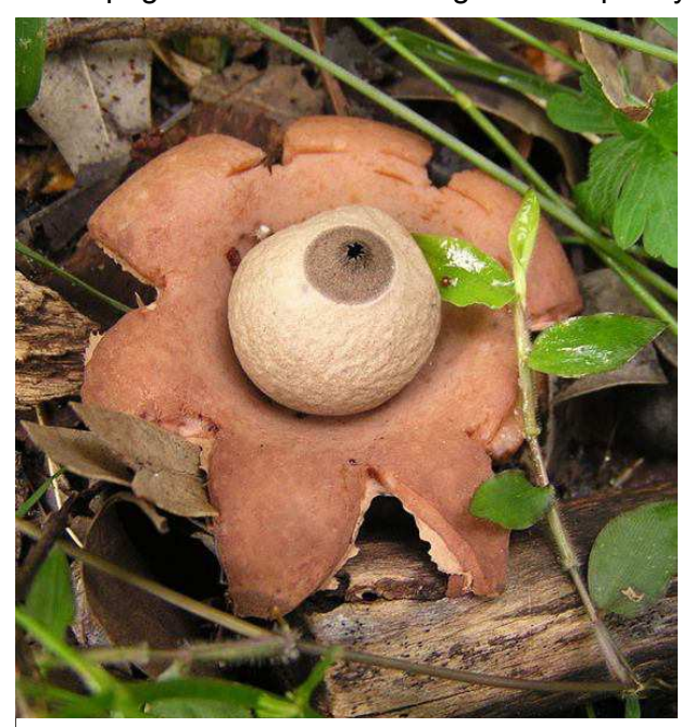
Fig 2. Earthstar Fungus (Geastrum saccatum). Photo.<sup>2</sup>

Returning to Haraway's haptic phrase "coshapings all the way down" and its implications for a poetic mycology of the senses, Section III examines selected poems from Douglas Stewart (1913-1985), Jan Owen (1940-) and Jaime Grant (1949-). Owen's "Fungus," Stewart's "The Fungus," Grant's "Farmer Picking Mushrooms" and "Mushrooms after Rain" call into question optic-olfactory-haptic "coshapings," particularly through the shared emphasis of their works on the repugnant odours of fungi. Their poetry exhibits grappling with mycotal alterity and