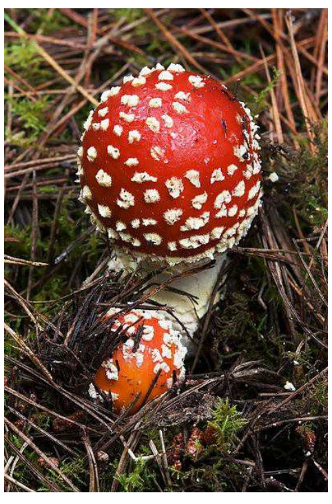
Fig 3. Fly Agaric (Amanita muscaria). Photo.

As in Owen's work, smell is the prominent sensory faculty as "reek" and "leathery stench of corruption and poison" (I. 3) register. Chemically, the active principle, muscarin, is a complex ammonia, producing a urine-like odor in the toadstool (Cleland 18). Stewart's visual and olfactory consternation culminates in the animalisation of