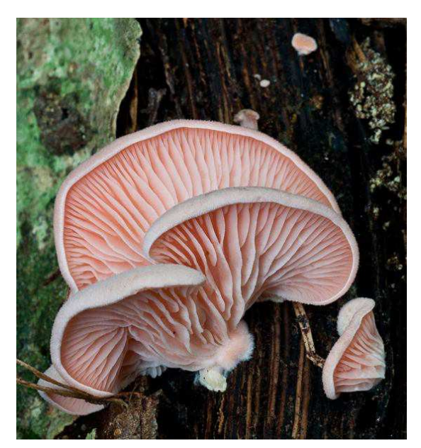
Fig 4. Pleurotopsis longingua. Photo.4

bodily interaction with fungi; Stewart, bodily protection from. Here Grant conveys a tone of vindication in the final line and hope for the restoration of the speaker's fractured body/psyche—