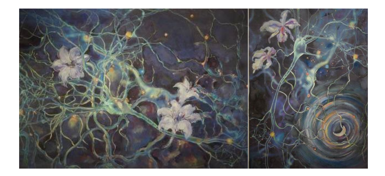
Figure 4: Author The Moon Down Bellow (details) 2019 Mixed Media on Printed found Image.

As I paint one canvas after another the subject matter and the formal structures remain the same. My paintings became subtler and more layered. But when I paint, the painting as a sensory object occupies my mind and body. These images are not a means to an end; I do not want to depict any particular object in the word. When I am