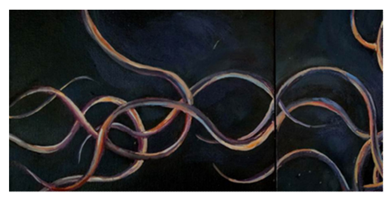
Figure 1: Author Untiled 2017 Mixed media on Canvas

As a practicing painter I have been fascinated by the way paint spreads across surface. My paintings are fantastic representation of neurons and brain images, emerging from dark backgrounds. These spread across the canvas in a chaotic manner while different shades of fluorescent lights glisten on the tentacles. These tentacles could be branches of trees and blood veins, but it is arranged in a manner that it invites the viewer's eye to move with it, and induces a tactile sensation. (2017)