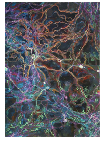
Figure 2, 3: Author Inside I and II 2019 Mixed Media on Printed found Image.