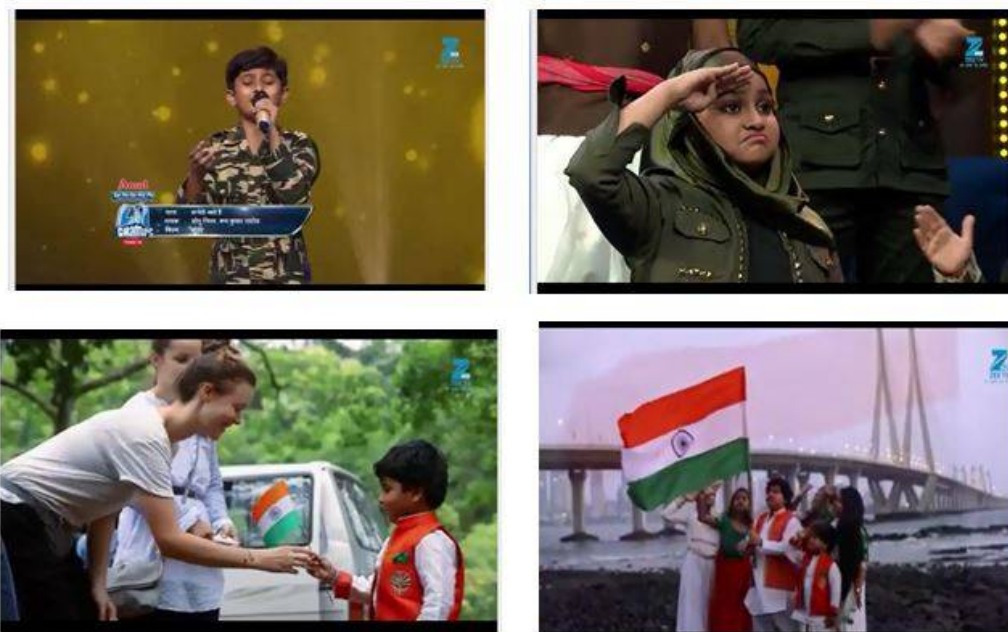
Image2: Glimpse of "Sa Re Ga Ma Pa" Indian Reality TV Show

and reproduced, so the national context of reality television can also be considered as identity performances. Through the cameras, the contestant's performances, their feelings, their thoughts about the challenges, and reactions of parents, and judges used to convey 'reality' to its viewers. We can identify the representation of India as a 'family' through the participation of the contestants from the state namely; Andhra Pradesh, Delhi, Karnataka, Maharashtra, Madhya Pradesh, Odisha, Punjab, Rajasthan, and West Bengal. Cities like Darjeeling, Kolkata, Amritsar, Vishakhapatnam, Mumbai, Bhubaneswar, Faridkot, Bhatinda, Gwalior, Ludhiana, Barmer, etc. The covered location of different states and their cultural expressions through glimpse tries to connect the viewers with national context throughout the whole seasons of the Sa Re Ga Ma Pa show.